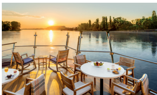
360° SHIP TOUR