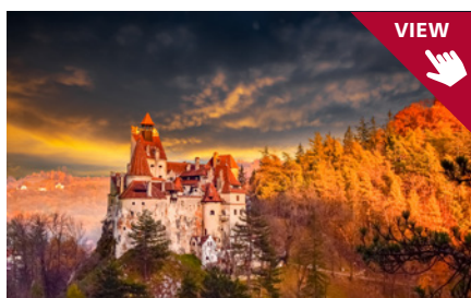
3 NIGHTS | BUCHAREST & TRANSYLVANIA

Extend your journey before or after your Viking cruise with our extension packages — designed to help you explore more of your embarkation or disembarkation point, or discover a new destination altogether. To determine which packages are available with your cruise, check the relevant itinerary or visit vikingcruises.com.au .