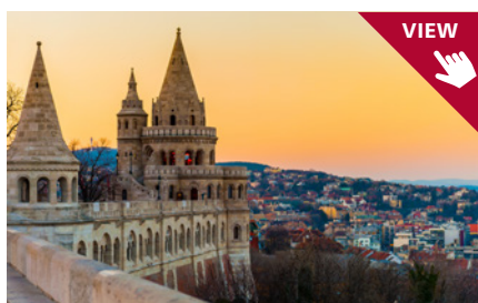
2 NIGHTS | BUDAPEST