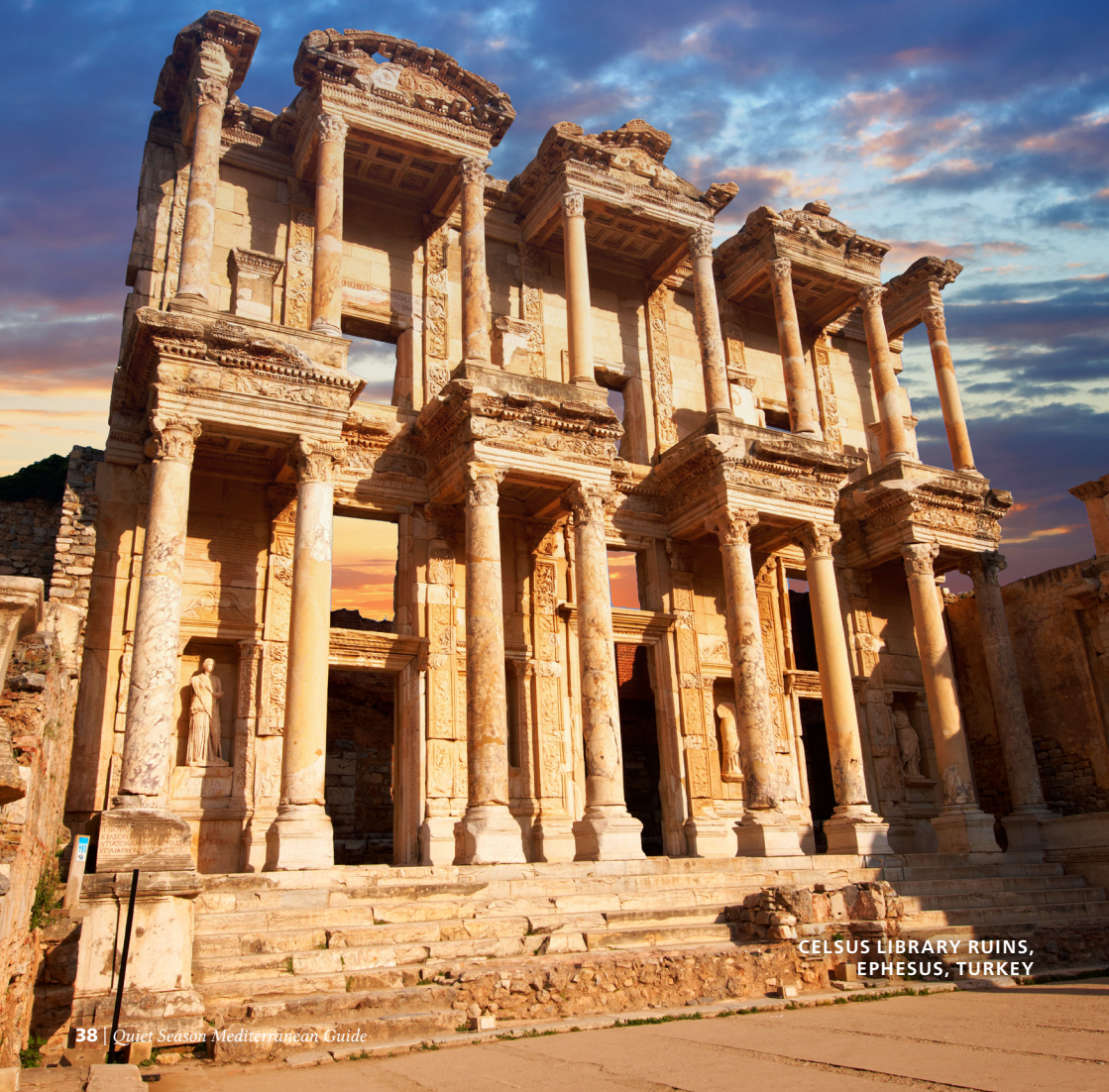
CELSUS LIBRARY RUINS, EPHESUS, TURKEY