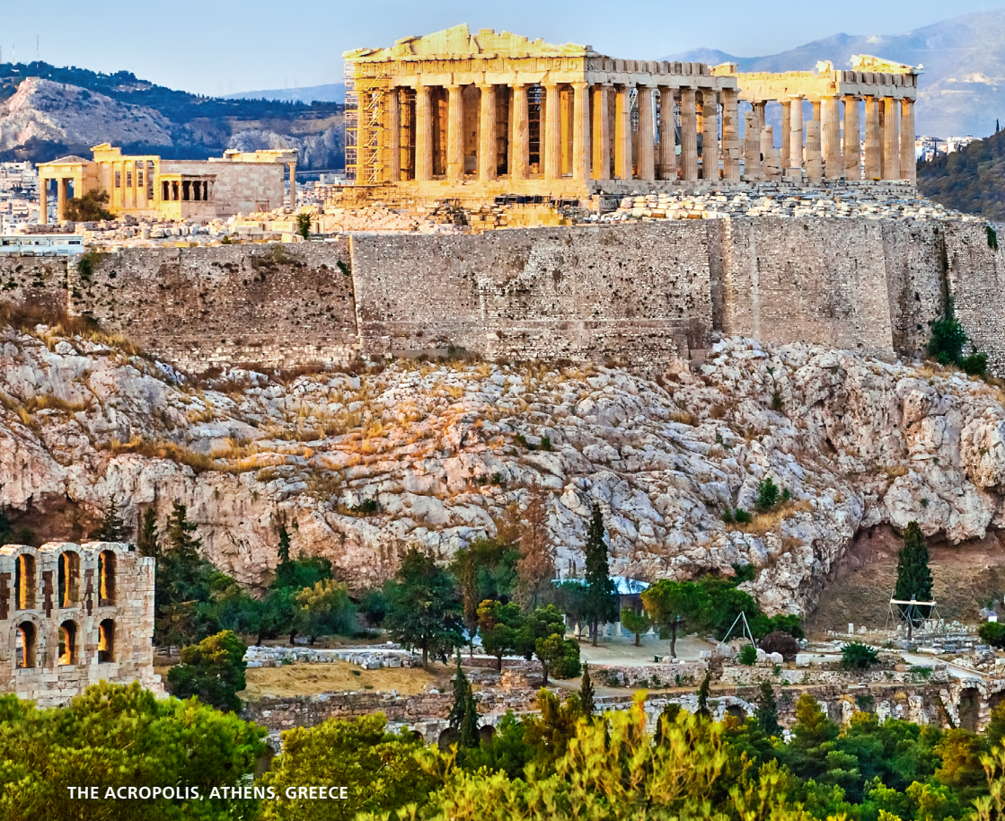
THE ACROPOLIS, ATHENS, GREECE