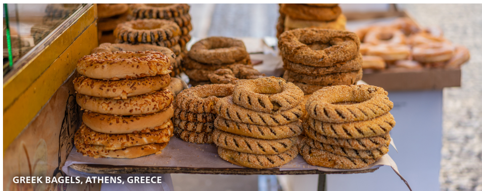
GREEK BAGELS, ATHENS, GREECE