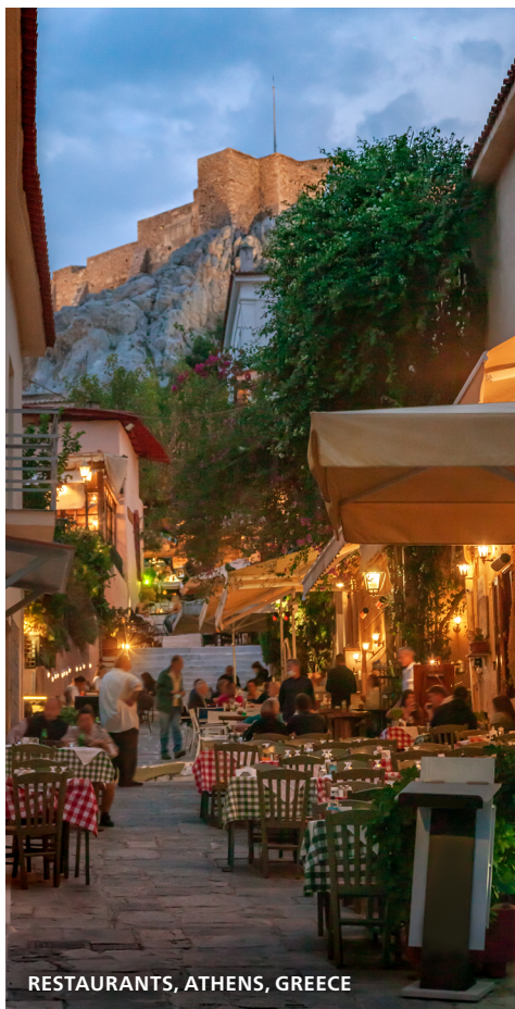
RESTAURANTS, ATHENS, GREECE