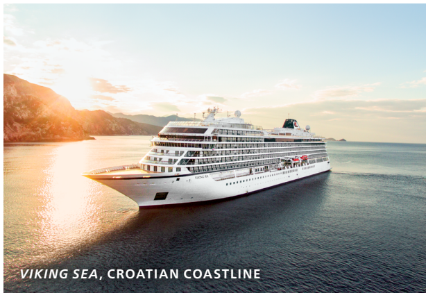
VIKING SEA, CROATIAN COASTLINE

We know well that our Viking guests are discerning, experienced travellers who crave authentic experiences that provide them with a deeper understanding of the world. And so, who better to explain what it's like to embark on a Mediterranean ocean voyage than those who know us best – our Viking guests.