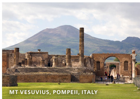
MT VESUVIUS, POMPEII, ITALY