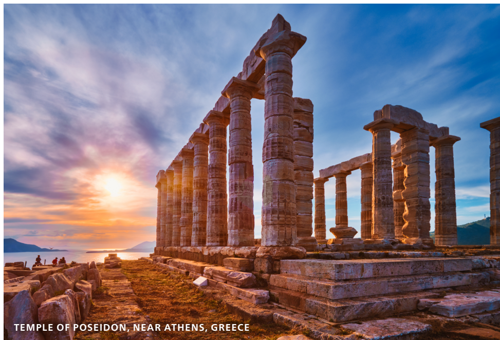
TEMPLE OF POSEIDON, NEAR ATHENS, GREECE