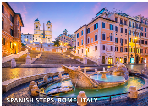
SPANISH STEPS, ROME, ITALY