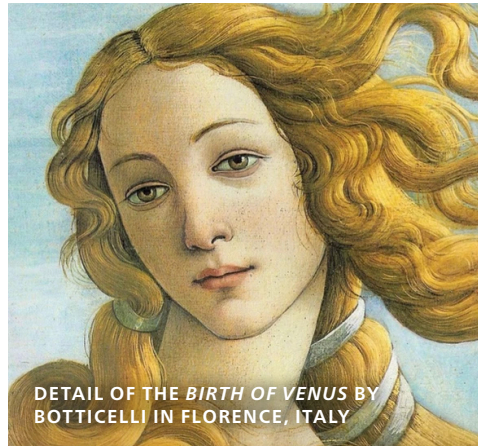
DETAIL OF THE BIRTH OF VENUS BY BOTTICELLI IN FLORENCE, ITALY

See Florence's treasured works of art and at one of its renowned museums. During the Medici rule, Florence exploded into a Renaissance of art and culture and the legacy lives on around every corner. Drive with your guide to the Uffizi Gallery. Here, gaze upon brilliant works by Da Vinci, Botticelli, Michelangelo, Rembrandt and others. Then, take a walking tour of the city, passing the magnificent Basilica di Santa Maria del Fiore with Brunelleschi's Dome and the Baptistery, adjacent to the Giotto's Bell Tower. Pass the Accademia Gallery and learn about some of Michelangelo's flawless sculptures, including his famous David, and many other great works of art.