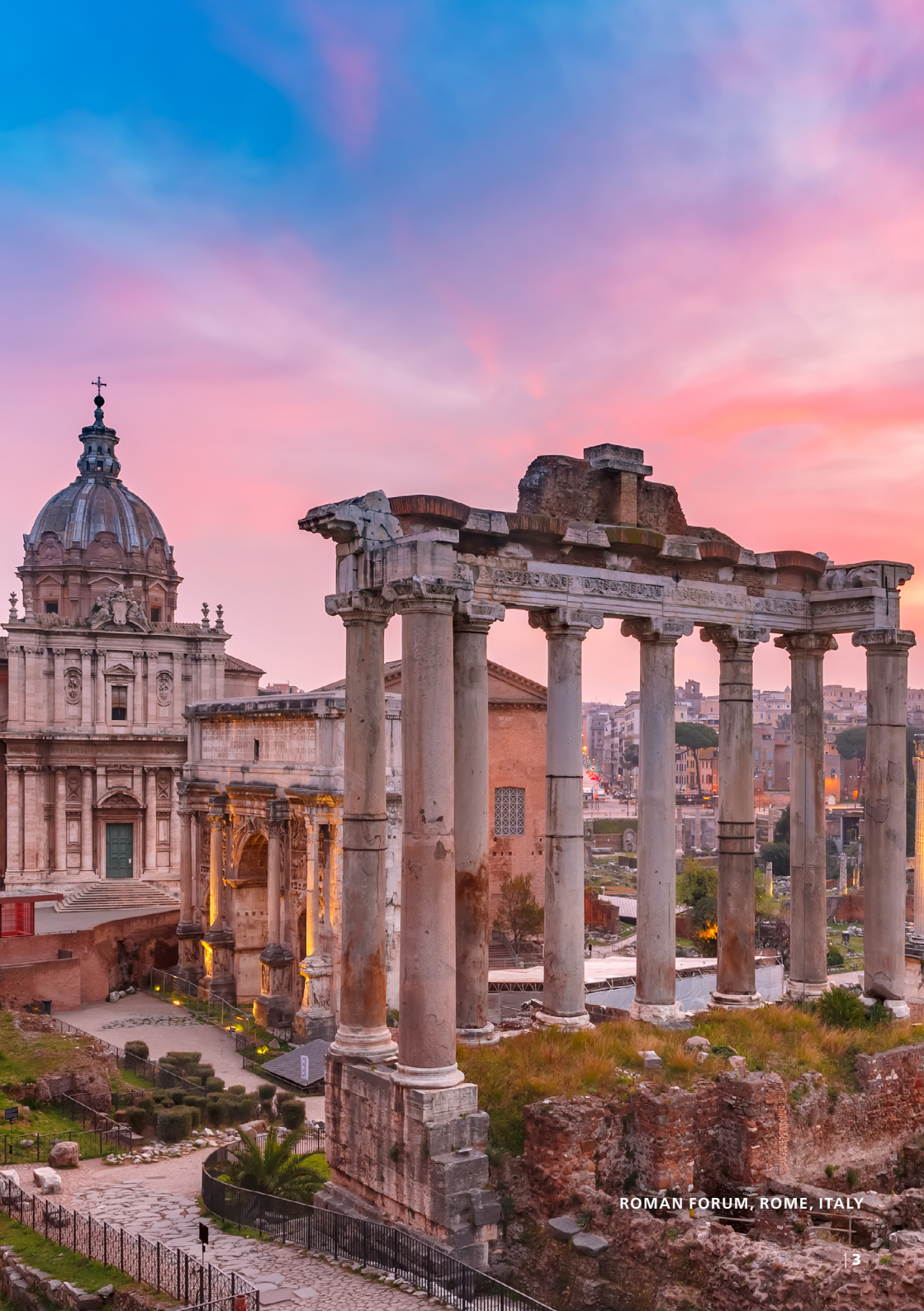
ROMAN FORUM, ROME, ITALY