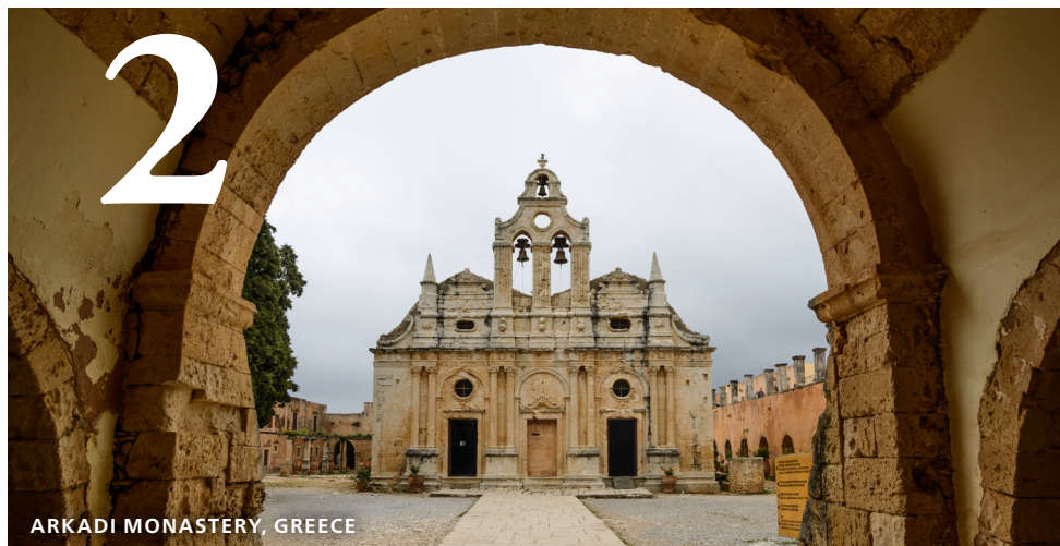
ARKADI MONASTERY, GREECE